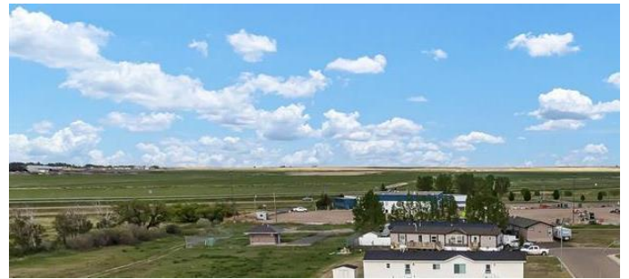
127 Meadowplace Dr E, Brooks, AB

Main Floor Exterior Area 1517.55 sq ft Interior Area 1381.31 sq ft